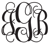
script monogram Return Address in Eaves Small Caps

AAA BBB CCC DDD EEE FFF GGG HHH III JJJ KKK LLL MMM NNN OOO PPP QQQ RRR SSS TTT UUU VVV WWW XXX YYY ZZZ